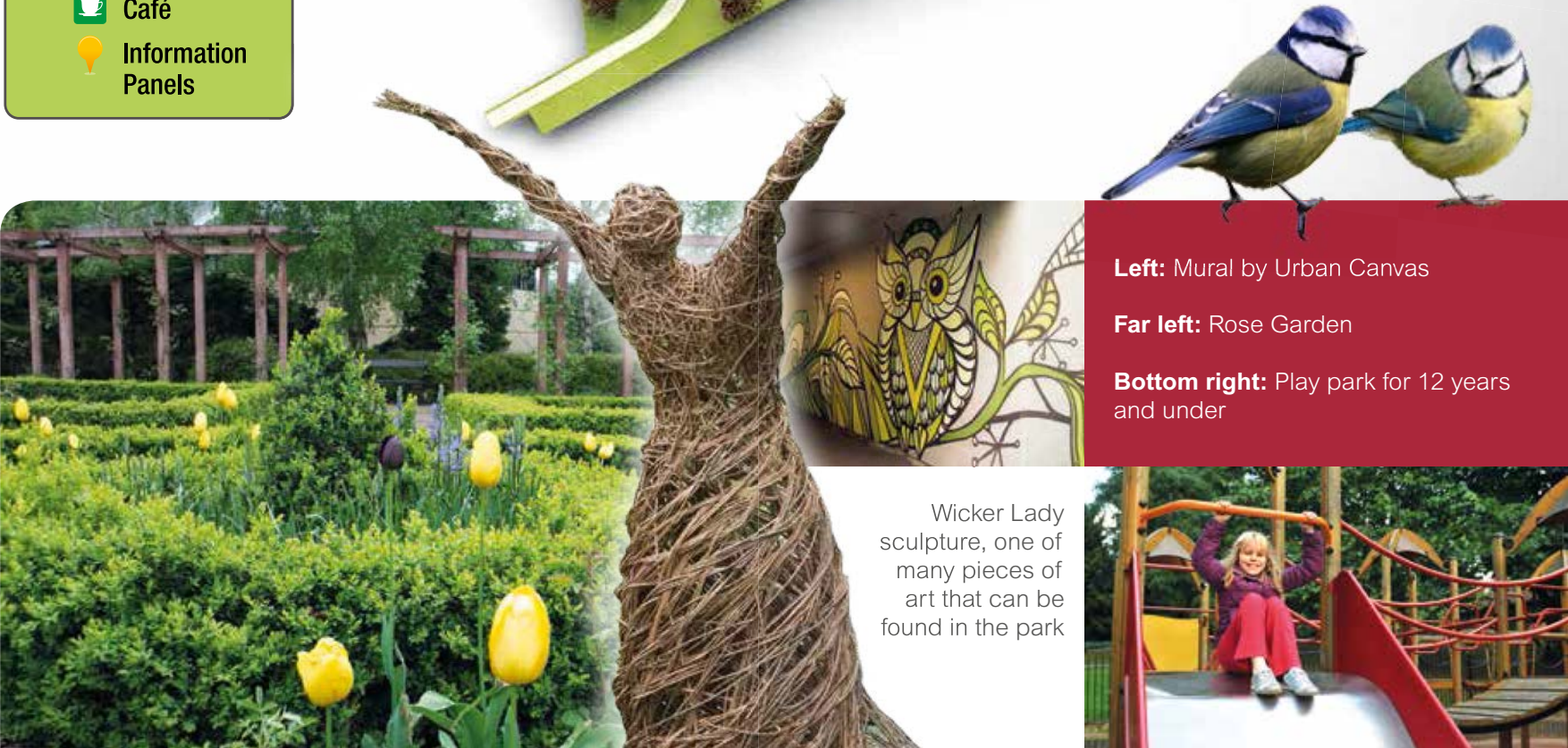
Left: Mural by Urban Canvas