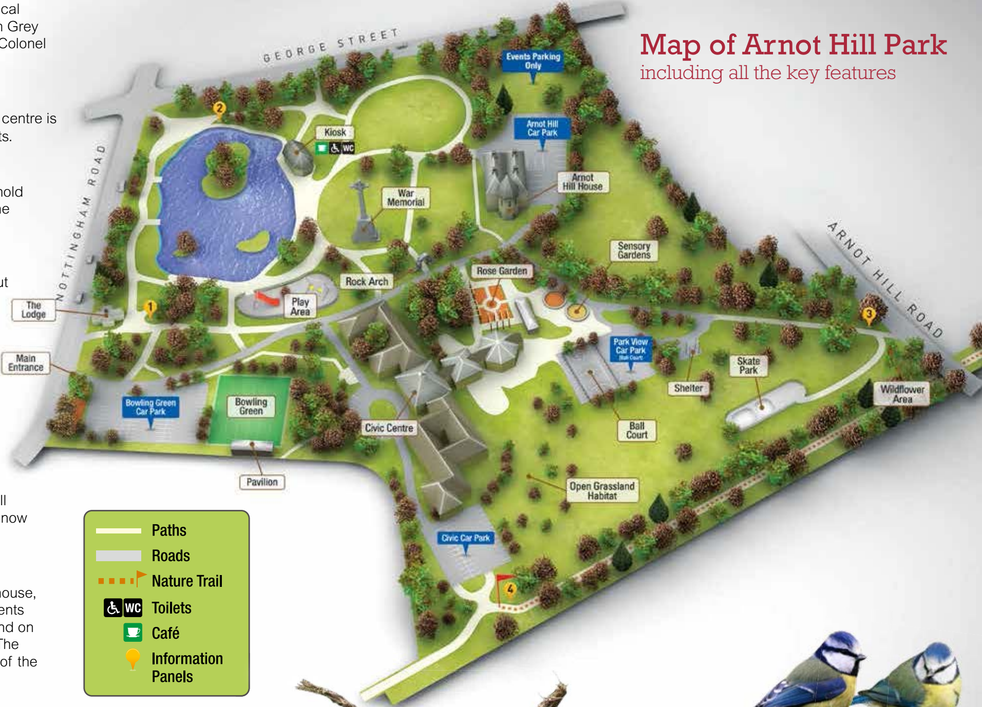
Map of Arnot Hill Park including all the key features

Use the 'Tree Trail' leaflet to learn more about the wealth of historical trees, which, create Arnot Hill Parks landscape.